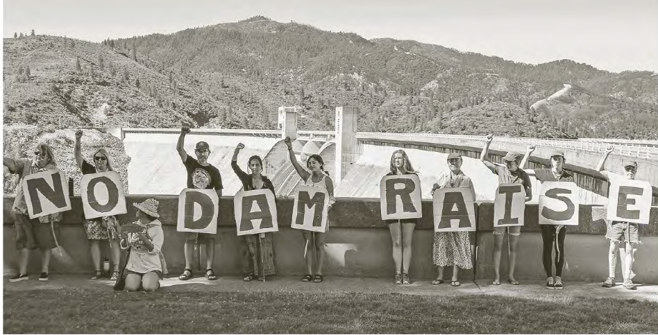
Direct action at Shasta Dam—the 602-foot-high salmon killer.